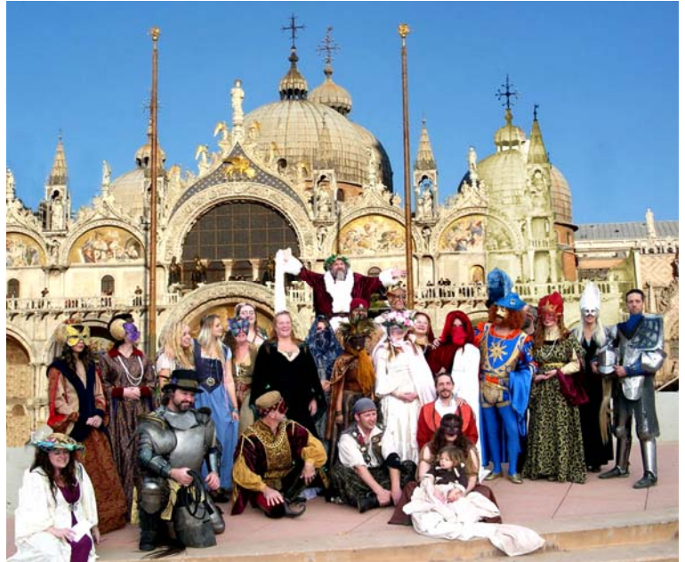
Holiday Carnevale Revelers in Ventura. (Photoshop'd Venice backdrop)**

By March, enthusiasts will be able to join a Costume Registry on the Carnevale Ventura website at www.carnevaleventura.org . What’s your costume going to be?