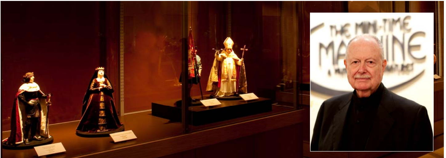
The Mini Time Machine Museum exhibit spans 400 years of Arizona History.

The timing could not have been better, as Arizona was celebrating its statehood centennial. It was the perfect opportunity to exhibit Historical Figures® at the Mini Time Machine in Tucson and for Mr. Stuart to give two performances about the path to statehood.