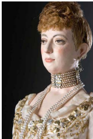
Queen Alexandra of England