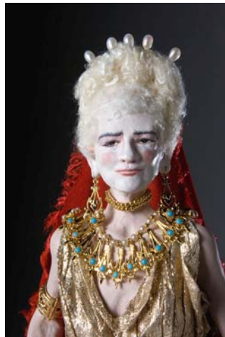
Livia Drusilla Augusta