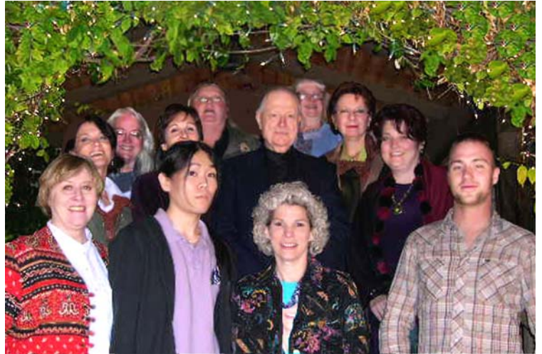
With new knowledge and skills, participants left with praise for the workshop.