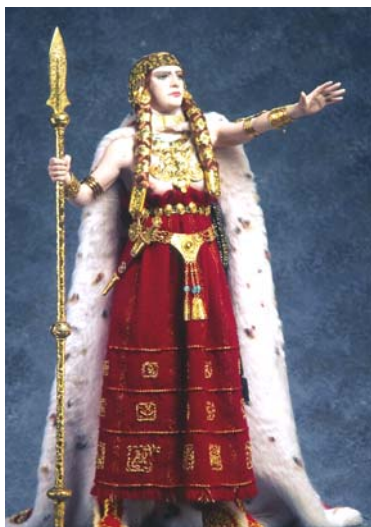
Mythical Brunhild, symbol of power