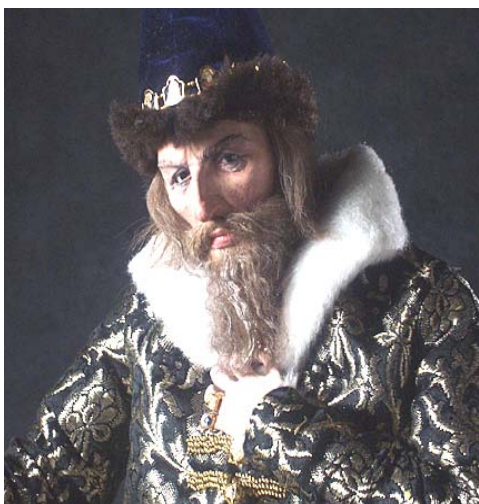
Ivan IV The Terrible