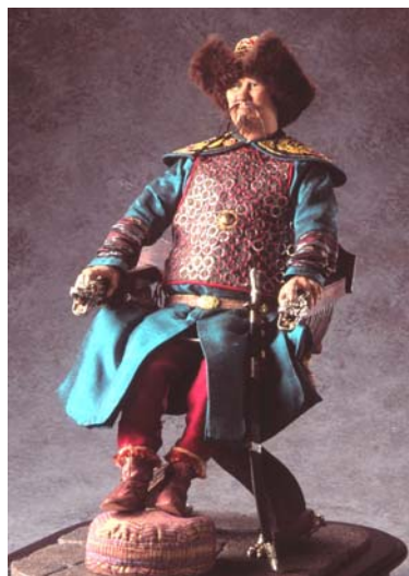
Was legendary Etzel Attila the Hun?