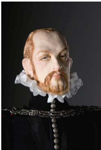
Philip II of Spain