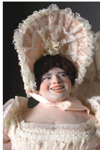
Caroline of England