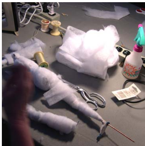
"Muscles" are formed from polyester wadding.