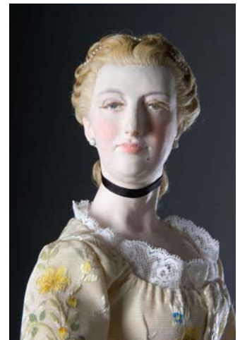
Mount Vernon Lass