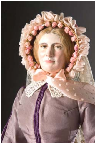
Mary Todd Lincoln

Images of the collection will be available in mid 2008 on the gallery website in the Early Works Group at www.galleryhistoricalfigures.com .