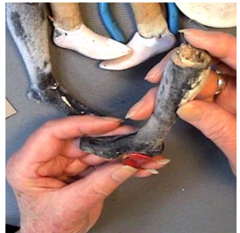
Stuart presented a session on shoe making.