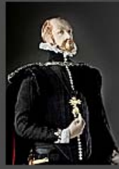
King Philip II