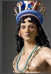
Minos of Crete