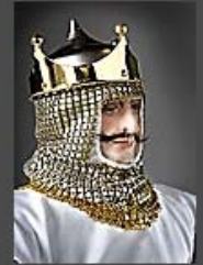
William the Conqueror