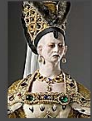
Isabeau of Bavaria