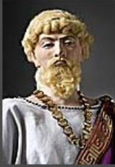
Dionysius of Syracuse