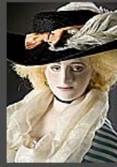
Maria Fitzherbert (young)