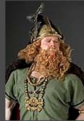
Erik the Red