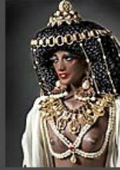
Queen of Sheba