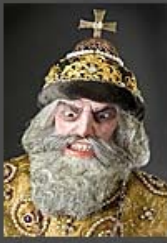
Tsar Ivan IV v1