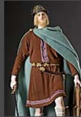
Alfred the Great