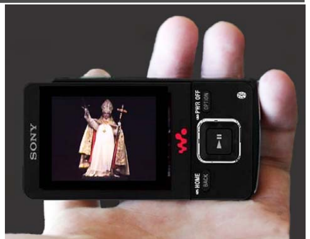
PMP Technology for watching, listening, viewing multimedia