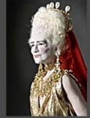
Livia Drusilla Augusta