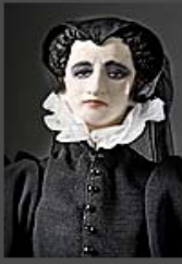
Catherine De Medici