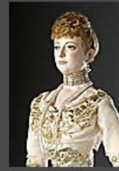
Alexandra Princess of Wales