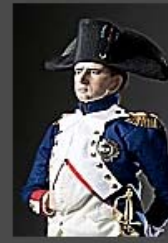
Napoleon Bonapart V1