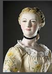
Mt. Vernon Lady