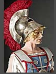
Alexander the Great