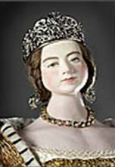
Queen Victoria 1837 V1