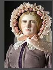
Mary Todd Lincoln