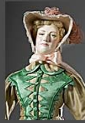
C. 1815 Walking Dress