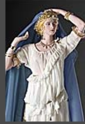
Helen of Troy