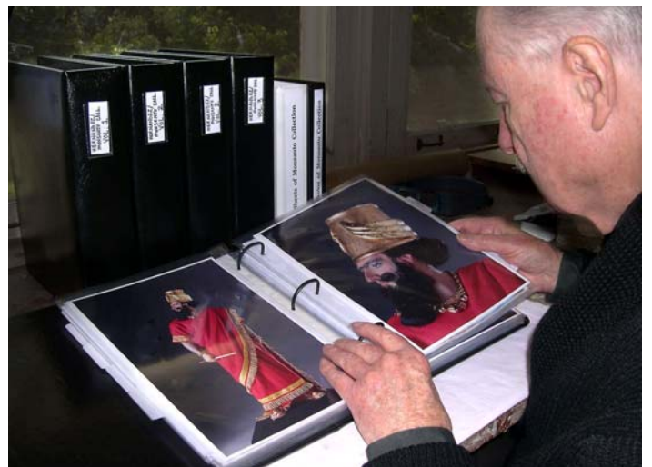
Detailed records of the restoration will be archived and sent to owner.

Images and stories about the collection can be viewed on the Early Works Group Page of the gallery website at— www.galleryhistoricalfigures.com .