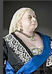
Queen Victoria 1900 V1