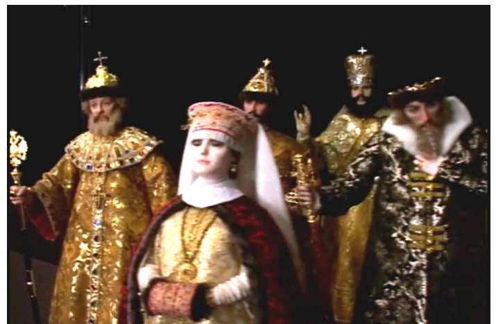
Guests viewed video trailer of "Russians" documentary now in post production at CAPS. Figures from MVC and Stuart collections.

The Foundation is actively seeking additional board members with skills and resources in management, fundraising, museum liaison, world history education and multimedia development. Suggestions may be emailed to info@galleryhistoricalfigures.com