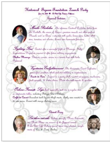
Special menu featured dishes of famous French Figures