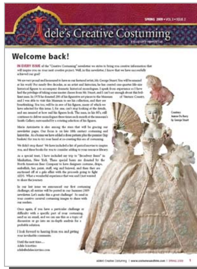
Spring 2009 Issue Cover

The article can be viewed online at http://www.costumesandtrim.com .