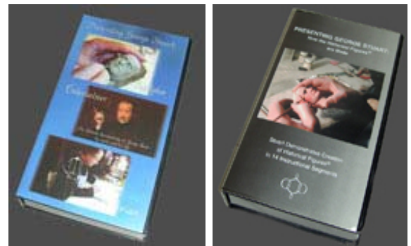
Limited supply of classic VHS tapes

Quantities are limited. Order by mail and include CA sales tax, if applicable. Items are also available online at our website.