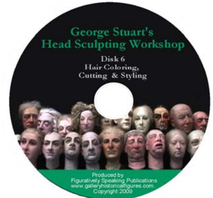
Hair DVD completes Head Workshop Series