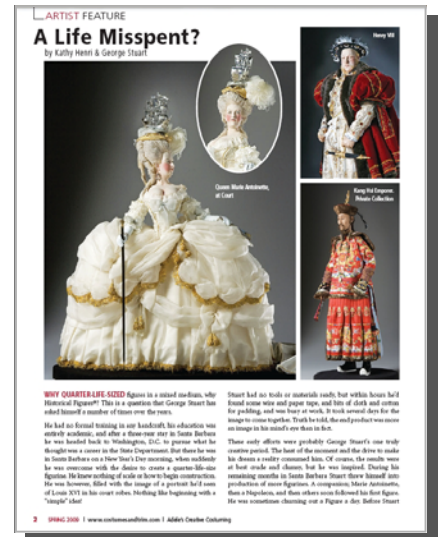
Nearly 30 images adorn article