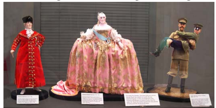
Catherine II, Elizabeth I and Nicholas II holding his ill son. Figures are from the Ventura Museum Collection.

The driving force behind the founding of St. Petersburg