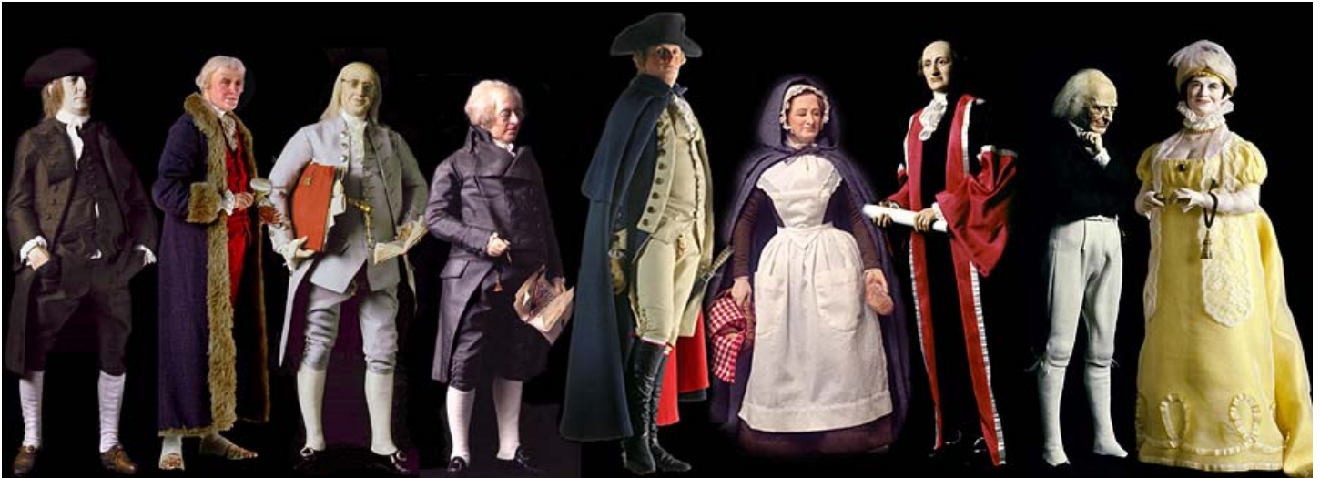
S. Adams T. Jefferson B. Franklin J. Adams G. Washington M. Washington J. Jay J. Madison D. Madison

In the second half of the year, the Yanks should join the British, French, Chinese and Russians on the Foundation's website at www.galleryhistoricalfigures.com . The Americans and Lincoln Era will be the final