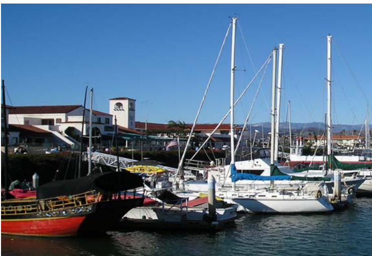
Ventura Harbor Marina, site of 2008 Meeting.