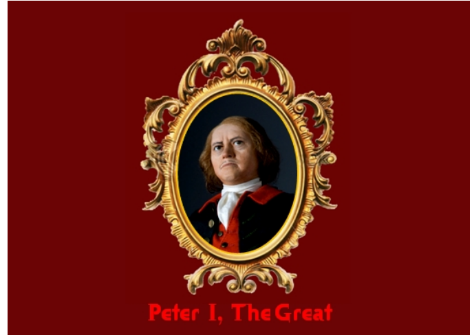
Peter I, The Great

Recent monologs have been sell-outs, so early reservations are highly recommended.