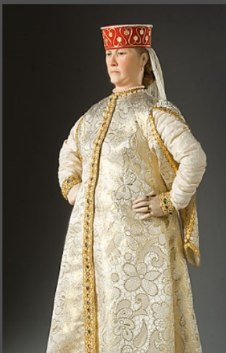
Figure from the Museum of Ventura County collection.

Home Gallery Historical Figures of Russia Stuart Support News Shoppe Contact Comments