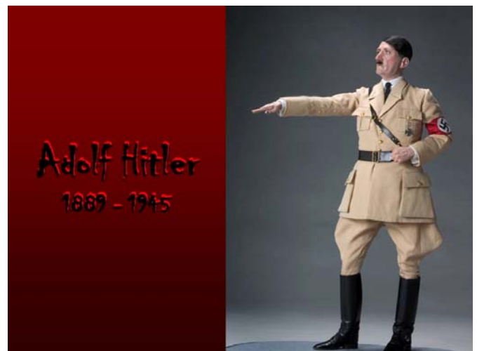
One of a dozen Really Awful People in Stuart Monolog.

Stuart will repeat the monolog on November 16 at 1:30 pm and 17 at 7:30 pm at the MVC California Street site. Reservations: (805) 641-1876 ext. 305. Tickets $10 for Museum members and $15 for non-members.