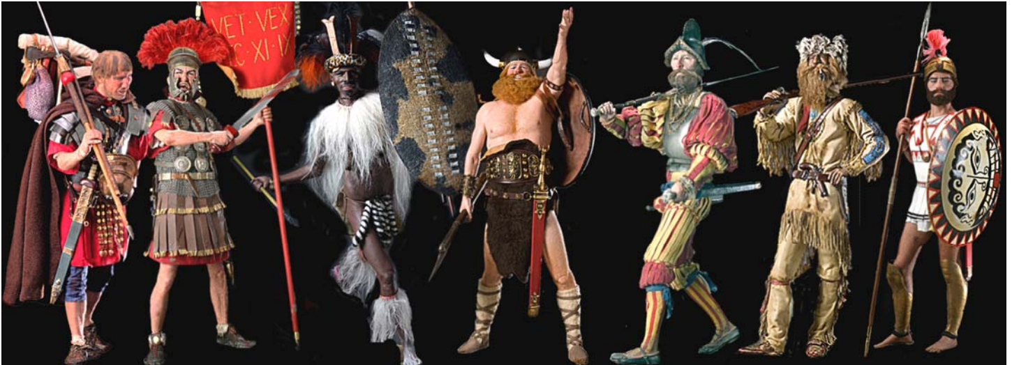
Foundation website now displays many generic figures that have not been exhibited for the public.

From the earliest times society has depended on the bravery of the hand-to-hand fighter to protect its people and interests. Even today soldiers are involved in kill-or-be-killed forays in Africa and the middle east.