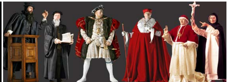
Movement West, Lincoln Era and Renaissance & Reformation Groups plus two other Groups are scheduled in 2009–2010.