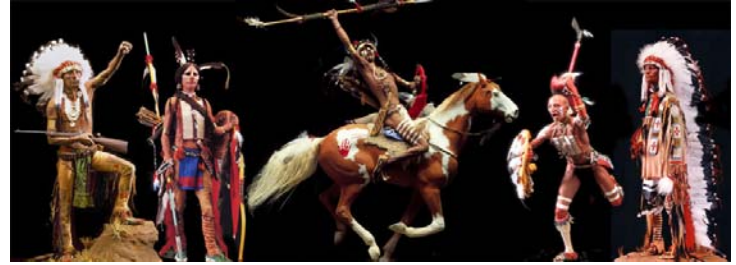
Peoples of the Americas—a new Group on Foundation website.

The Groups to be completed include Lincoln Era, Movement West, Renaissance & Reformation, Really Awful People and Germanic Myth & Legend. The Naples collection must also be photographed. With your annual subscription renewal, the Library can be completed in 2010.