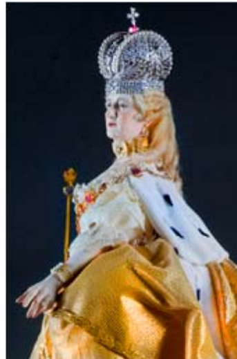
New Crown for Catherine II