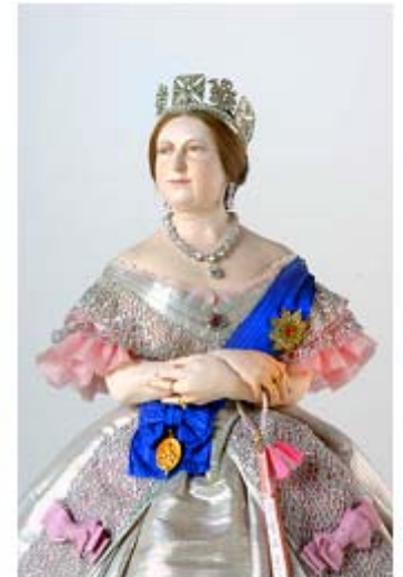
New Necklace for Victoria