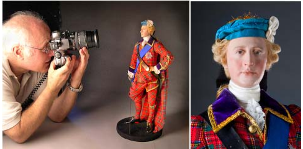
D'Aprix captures digital portrait of Bonnie Prince Charlie, ill-fated pretender to English throne.

In September, D'Aprix completed digital portraits of the English group, nearly 1,000 images in all. The images will debut on our new website now under development. More than 5,000 additional images will be required to capture all Figures in Ventura and Ojai.