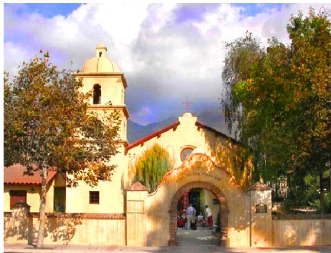
Museum is located 130 W. Ojai Avenue in downtown Ojai.

Tourists will now be able to see more than 50 Historical Figures between the Ojai Valley Museum, Ventura County Museum of History & Art and the Gallery of Historical Figures. For hours call 805-640-1390.