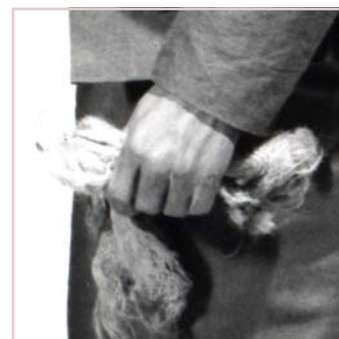
Even the early figures, showed Stuart's exacting attention to detail.