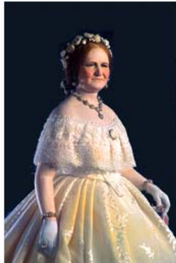
New Jewelry Set for Mary Todd Lincoln