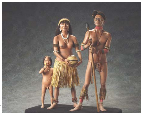
Chumash Indians once inhabited the region that is now Ventura and Santa Barbara Counties.

For exhibit dates and hours call 805-640-1390 or visit the website at www.ojaivalleymuseum.org .