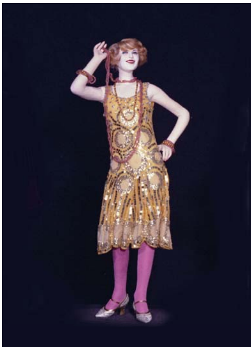
Attire depicts Mistinguett in Roaring Twenties

At an early age Jean Bourgeois aspired to be an entertainer, singing popular ballads while selling flowers. An acquaintance made up the name Miss Tinguette , which Jeanne liked but modified. She debuted as Mistinguett at the Casino de Paris and also performed at Folies Bergère, Moulin Rouge and El Dorado. Her risqué routines captivated Paris and she went on to become the most popular French entertainer of her time and the highest paid female entertainer in the world. In 1919, her legs were insured for the then astounding amount of 500,000 francs.