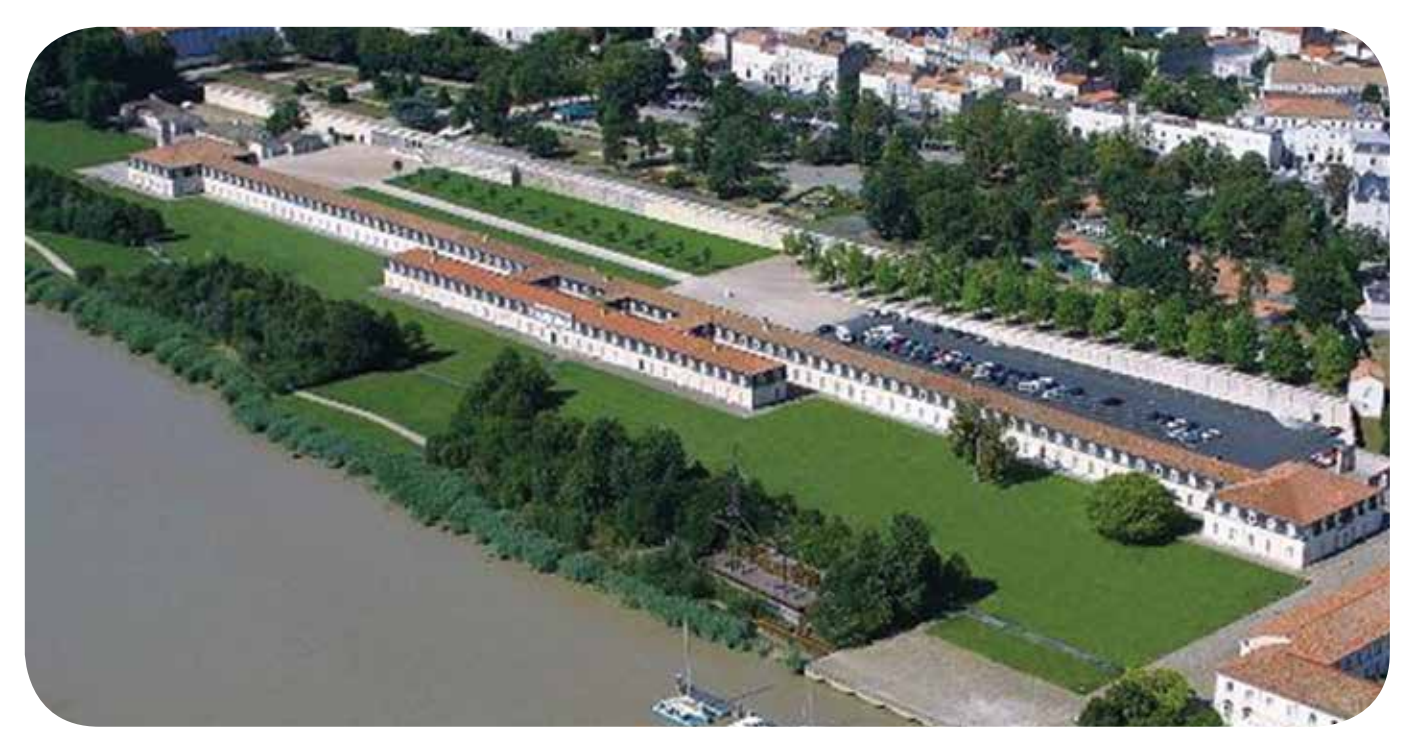
Photo 6. Aerial view of the superb Corderie Royale, on the banks of the Gironde.

were subsequently damaged by German occupation forces during WWII.