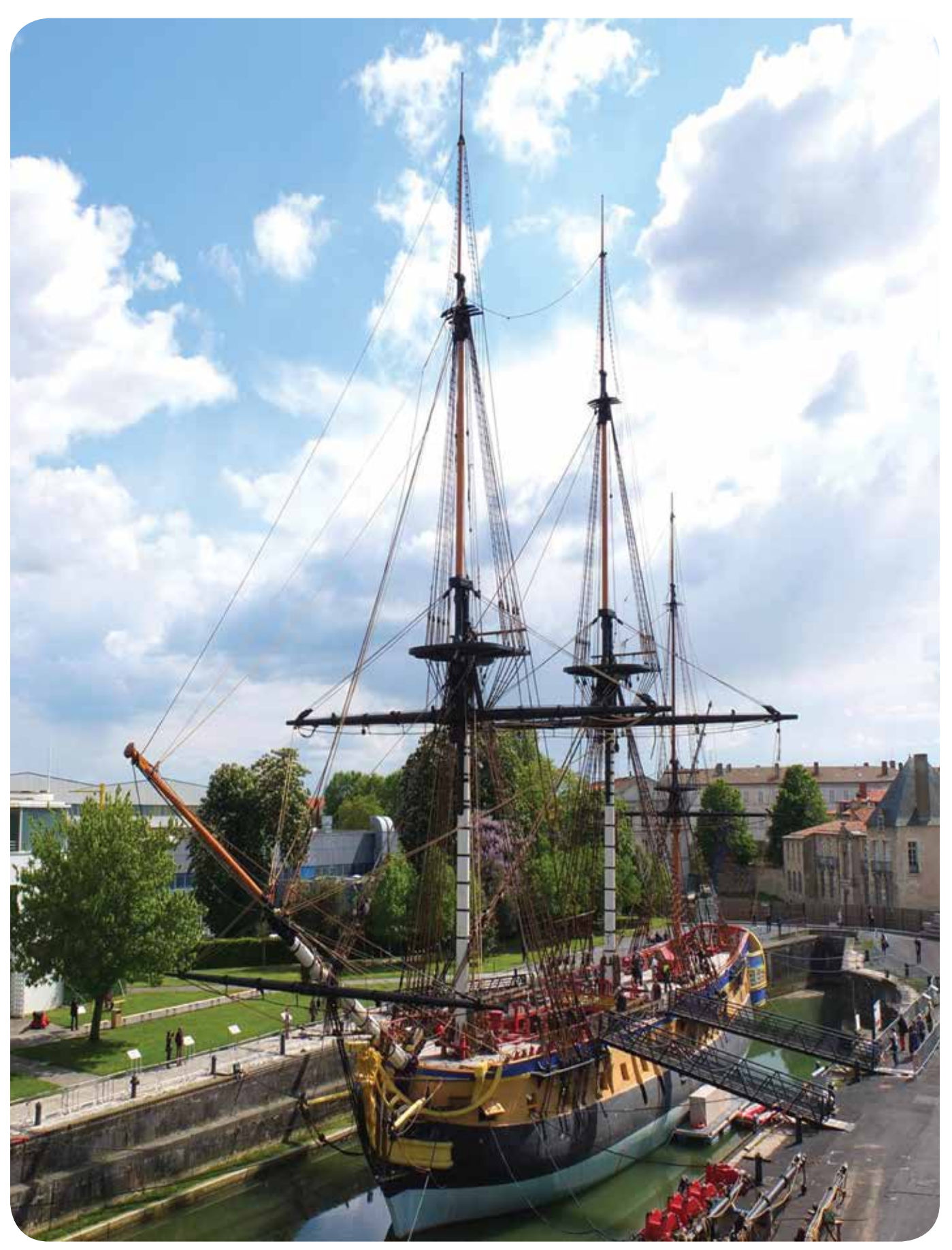
Photo 5. With her launch and masting completed, the new Hermione awaits her topsail and topgallant yards and completion of her rigging, in the Spring of 2013.