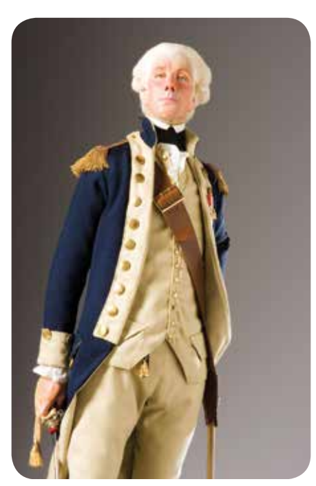
Photo 2. The Comte de la Fayette, a striking historical figure constructed by George Stuart of California.

The peak of his American military career was in commanding troops at Yorktown where the British general, Cornwallis, surrendered on 19th October 1781 to the combined American and French forces under the command of