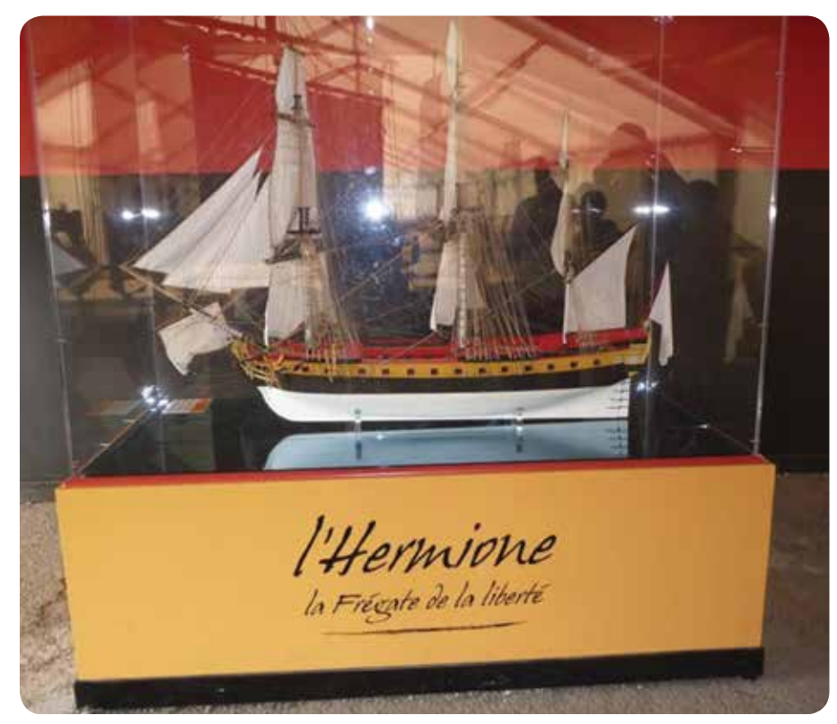
Photo 3. Fine 1:36 model of l'Hermione on display adjacent to the dock.

to Spanish River, where they picked up a cargo of coal and delivered it to Halifax. This clash is often called 'The Naval Action off Louisbourg', though in fact it took place some way from that town